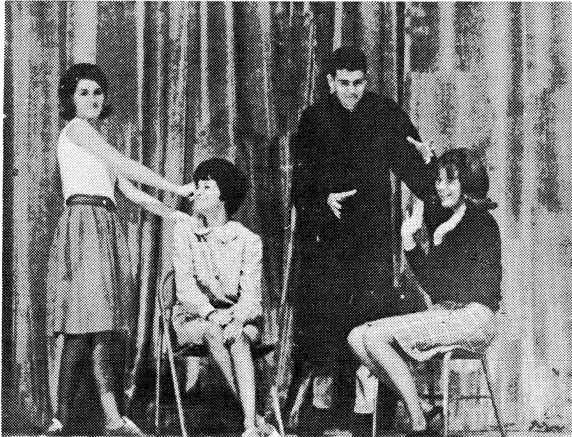
SENIORS REHEARSE FOR PLAY